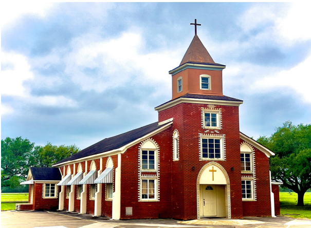
St. Anne Mission CR 622 at FM 686, Dayton/Eastgate, Texas

Confession is Saturdays at 4:30 p.m. or by appointment.