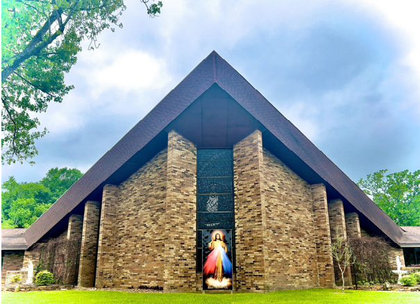
St. Joseph the Worker 804 S. Cleveland St., Dayton, Texas

Mission Statement We are a Roman Catholic community united by faith in God, nourished by Jesus through both the Word and the Eucharist and empowered by the Holy Spirit. We strive to meet the spiritual and physical needs of our growing parish family and community through prayer, faith formation, evangelization, stewardship, fellowship and social justice.