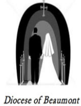
Diocese of Beaumont

Is a program of the Diocese of Beaumont Office of Family, Marriage, and Youth Ministry